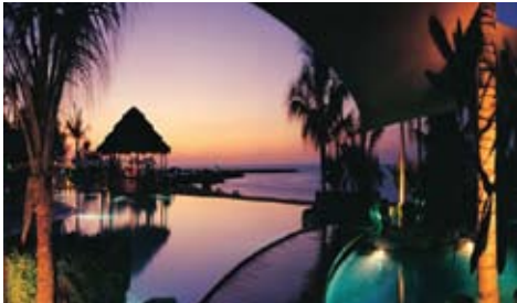
Le Meridien Mina Seyahi Beach