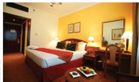
The Marco Polo

Centrally located in the Deira District of Dubai, the Marco Polo Hotel is close to several shopping malls and main cultural attractions. Some of the notable landmarks include Narish Khyma Museum, Cuisine Museum, Mamzar Park and Mushrif Park. All accommodation units are comfortably arranged and feature an array of modern facilities such as air conditioner, cable TV, hairdryer, jacuzzi, mini bar, telephone, Internet access and a private bathroom.