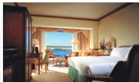
Sheraton Dubai Creek & Towers

Sheraton Dubai Creek Hotel & Towers is situated directly on Dubai Creek. The hotel features a brand new look with an elegant honed limestone interior, and a luxurious landscaped front entrance and spacious lobby. The hotel is within walking distance from the city's main commercial, shopping districts and the gold Souk. Spread out in one of the 262 spacious guest rooms and suites and take in uninterrupted views of the Dubai Creek or city.