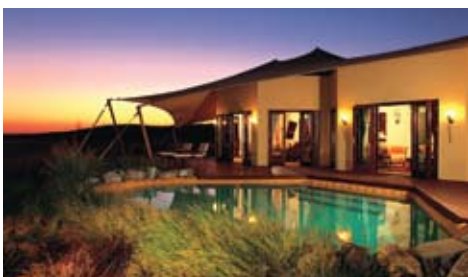
Al Maha Desert Resort