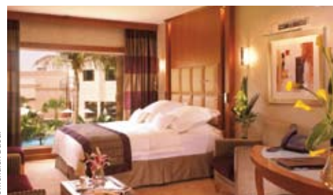
Le Meridien Dubai

Surrounded by 38 acres of landscaped gardens, Le Méridien Dubai provides a serene and luxurious counterpoint to the city's cosmopolitan flair. A short distance from the Deira City Centre shopping hub, Dubai Creek Golf and Yacht Club, and the Gold Souk, the hotel puts the city's unique experiences within easy reach. The hotel consists of 383 rooms plus three outdoor swimming pools, Natural Elements Spa, a state of the art gym, and tennis courts.