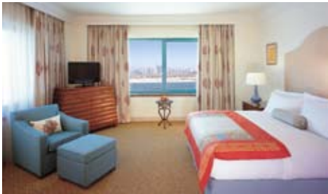
Atlantis, The Palm