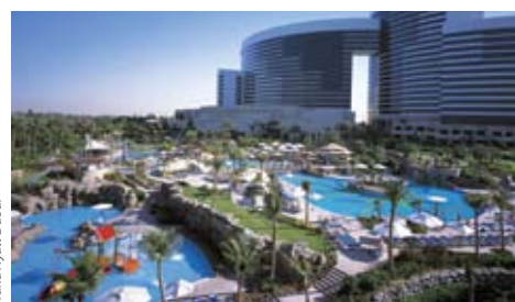
Grand Hyatt Dubai

Located in the Bur Dubai district, Grand Hyatt Dubai Hotel towers majestically at the edge of Dubai's historic creek. Set within 37 acres of landscaped gardens, this hotel is an outstanding combination of resort facilities, luxury hotel rooms & suites, residential apartments and one of the most advanced conference hotels in the UAE. The hotel hosts a wide array of restaurants, bars and cafés, mostly located around the tropical garden of the atrium.