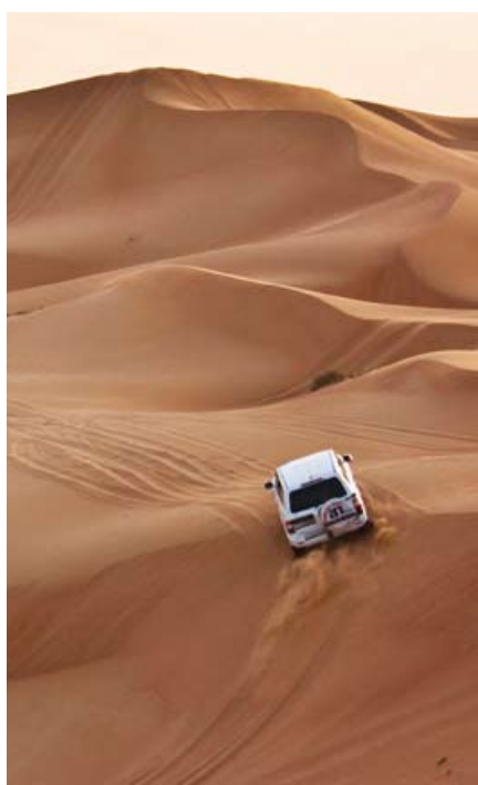
Driving Over The Dunes