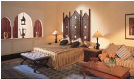
Mina A'Salaam - Royal Suite