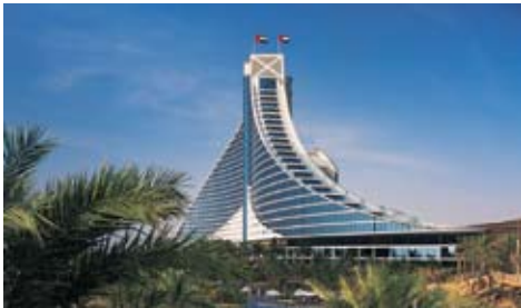
The Jumeirah Beach Hotel