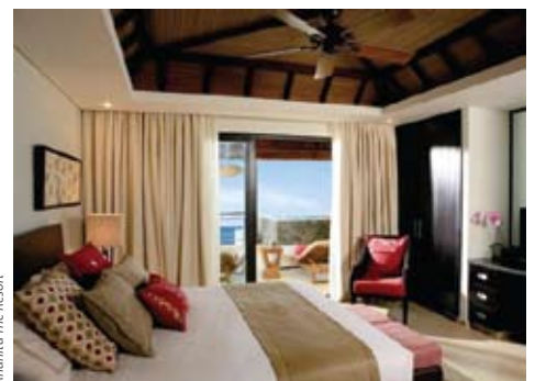
Anahita The Resort

Anahita The Resort is a luxury resort set in the stunning beauty of the island's east coast. The 70 elegant one, two and three bedroom suites have either breathtaking views of the turquoise lagoon or views of the lush golf course with a stunning mountain backdrop. Ideally situated, the suites offer the ultimate in privacy and are just a short stroll away from the beach and the many resort amenities. From the village you can take a boat and a picnic lunch to Ile aux Cerfs. Upon your return you can dine by elegant lamplight at Origine restaurant or have a sunset cocktail at the bar.