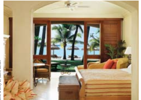
One & Only Le Saint Geran

One & Only Le Saint Geran Hotel nestles on its own private peninsula on the coast of Mauritius. With reef waves, protected lagoon waters, and ocean breezes, the hotel boasts incredible aquatic recreational opportunities: windsurfing, wakeboarding, sailing, or snorkelling. All suites feature a private terrace facing either the ocean or cove, or a door opening onto a tropical garden. Spacious bathrooms are beautifully appointed, with cascading showers. All guests have personalised 24-hour butler service. One & Only Le Saint Geran offers exceptional dining experiences with 2 restaurants and world-class chefs.