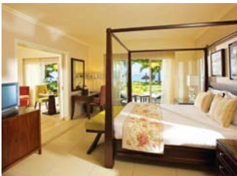
Sugar Beach Resort