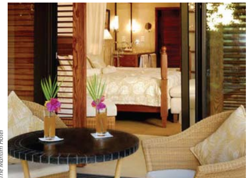
The Maritim Hotel

The Maritim Hotel Mauritius is a luxurious beach resort & spa of the highest international standard, picturesquely framed by a 25 hectare green, tropical garden and nature park and flanked by the Indian Ocean. The hotel is a perfect blend of tropical and colonial architecture which provide an elegant background for a sophisticated and yet totally relaxing vacation. The hotel features 215 elegant rooms and luxurious suites, the exclusive colonial-style 'Château Mon Désir' specialty restaurant and a fabulous wellness facility, 'Tropical Flower Spa'.