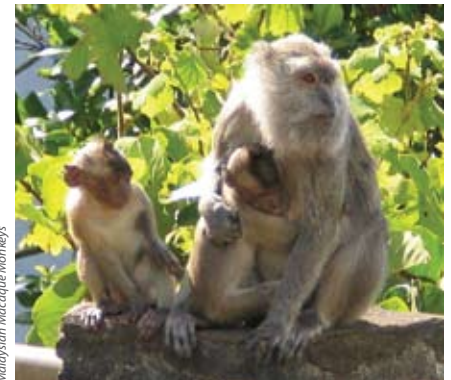
Malaysian Macaque Monkeys