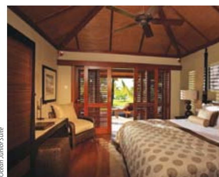
Ocean Junior Suite

Built in 1997, 'Les Pavillons' has been completely renovated to be in perfect harmony with its surroundings. Le Pavillons borders a fine sandy beach, protected by an off-shore reef and is sheltered by the impressive Morne Brabant. It has 64 superior rooms, 15 deluxe rooms, 10 junior suites, 15 ocean suites and 45 prestige junior suites. All rooms have a balcony and are sea facing. It is an ideal place for a Mauritian wedding, or for those looking for a tranquil place to spend their honeymoon. There are many complimentary activities such as windsurfing, kayaks, snorkelling, water-skiing, and tennis.