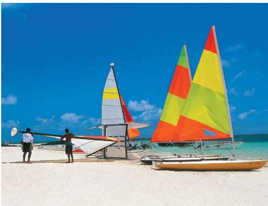
Water Sports at Beau Rivage