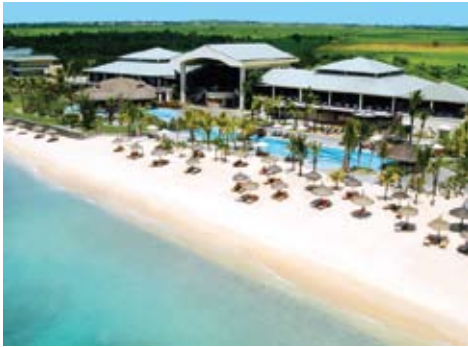
Le Meridien Ile Maurice