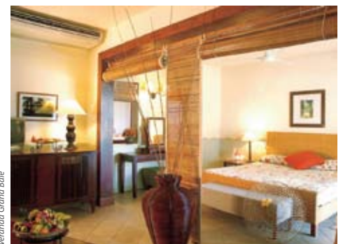
Veranda Grand Baie

For those who wish to combine the pleasures of sunbathing, beach relaxation and water sports with the joys of shopping in the heart of the bustling town of Grand Baie, Veranda Grand Baie Hotel & Spa is the perfect choice. The authentic Creole architecture of the hotel and the harmony of the environment welcome the visitor. Veranda Grand Baie is also home to the exclusive Veranda brand 'Seven Colours Wellness Spa'.