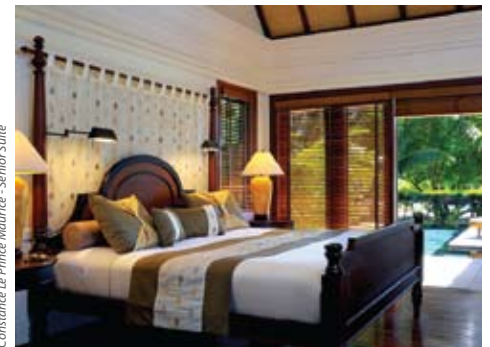
Constance Le Prince Maurice - Senior Suite

This luxurious five-star plus hotel blends naturally with the beauty and simplicity of the environment. The use of wood, stone and thatch give the Constance Le Prince Maurice hotel its unique charm, characterized by an ambiance of total tranquility and refined elegance. All suites are air-conditioned and equipped with minibar, TV with internal DVD channels, stereo CD player, WIFI (Wireless Internet Access), in room safe and outgoing fax. The suites feature massive wooden furnishing and the colors reflect the "spice route theme" touch of the hotel.