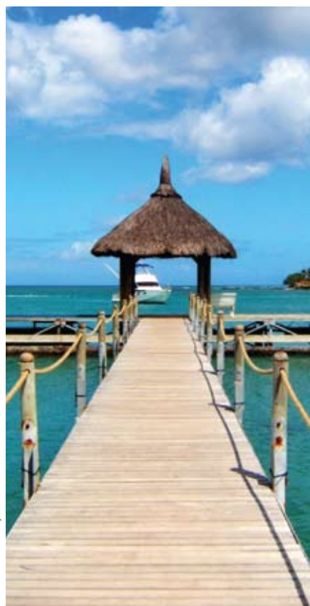
The Maritim Hotel - Jetty