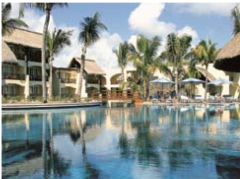
Constance Belle Mare Plage Hotel