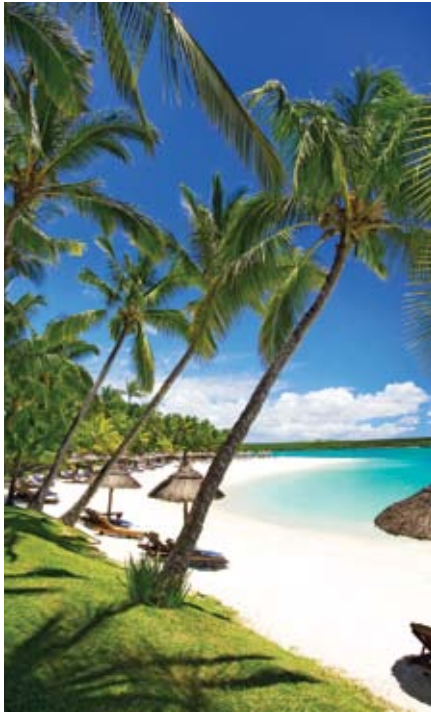
One & Only Le Saint Geran - Beach View