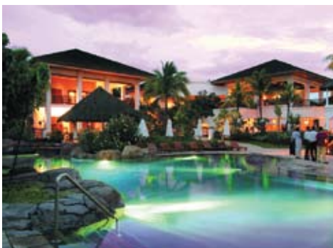
The Hilton Mauritius Resort & Spa