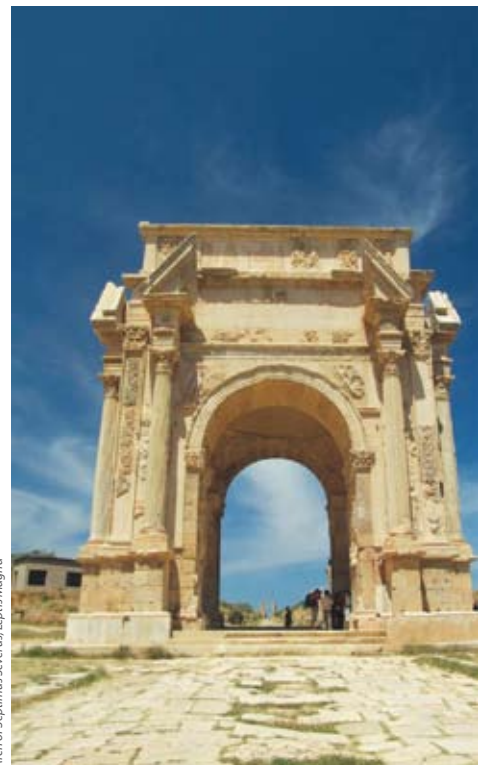
Arch of Septimius Severus, Leptis Magna

NOTE: Based minimum 2 passengers travelling together.