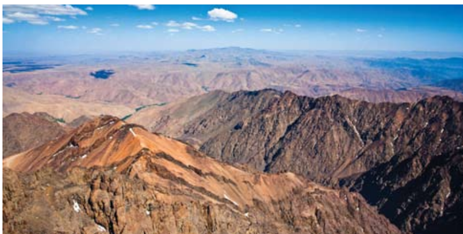
High Atlas Mountains

NOTE: Based minimum 2 passengers travelling together.