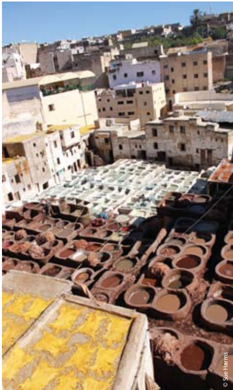
Dye Vats, Fes

Hidden away in the Medinas of Morocco's cities are traditional homes of serene beauty, built around internal courtyards. Known as 'riads', these are now increasingly being converted to provide magical accommodation for the discerning traveller. This itinerary combines hotels and riads and promises to be a feast for eyes, and a delight for the tastebuds.