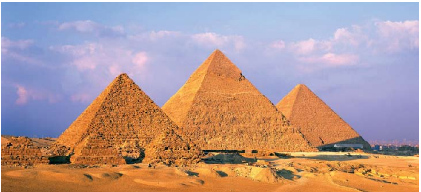
Pyramids of Giza

NOTE: Based minimum 2 passengers travelling together.