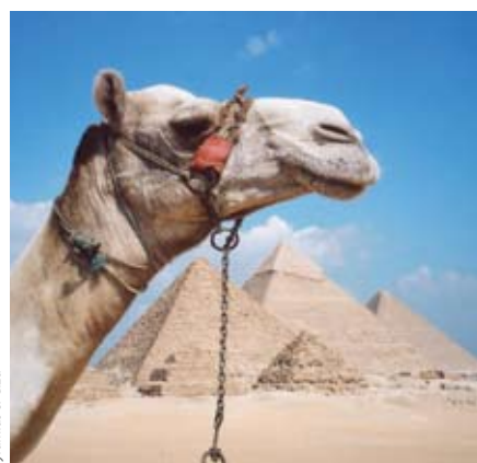
Pyramids of Giza