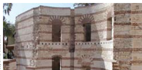
Babylon Fortress, Cairo

This tour visits Old Cairo, known as Coptic Cairo, including visits to Coptic Museum, Babylon Fortress, Hanging Church, Abu Serga church, and Ben Ezra Synagogue. It will also visit Islamic Cairo including, Refai Mosque, Ibn Tulun Mosque, the Islamic Museum or Gayer Anderson (if the Islamic Museum is closed).