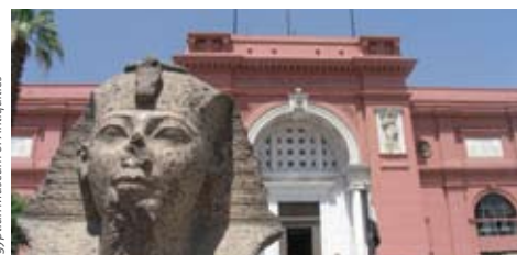
Egyptian Museum of Antiquities

The famous museum built in 1902 houses the world's largest collection of ancient Egyptian artifacts (more than 120,000 items on display) featuring the famous Tutankhamun collection with its beautiful gold death mask and sarcophagus. Your guide will introduce you to the museum's most important pieces before you have free time to explore at your leisure.