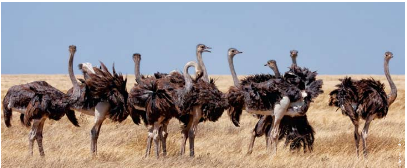
Female Ostriches, Serengeti

NOTE: Based minimum 2 passengers travelling together.