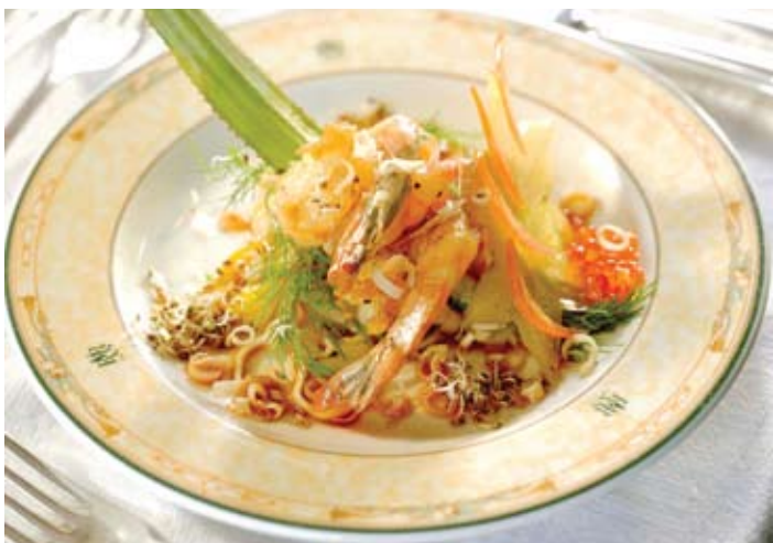
Light Salad Lunch