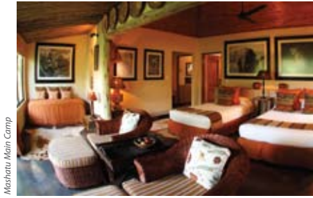
Mashatu Main Camp

This safari has been carefully planned to offer the best opportunity for game viewing in two very interesting and contrasting areas. Mashatu in Botswana is renowned for its game, especially leopard. It has varied activities on offer like mountain bike safaris and walking safaris with outstanding guides. Mala Mala offers not only luxury accommodation but some of the best game viewing in South Africa. This safari is suitable not only for singles and couples, also for families as all lodges are child friendly.