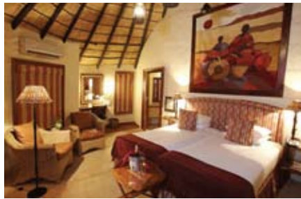
Mala Mala Main Camp

Mashatu Main Camp is the larger and more luxurious of Mashatu's camps, with 14 superbly decorated luxury suites. Each is furnished with two three-quarter beds, a day bed and expansive en suite bathroom. Facilities include a swimming pool, air-conditioned lounge and dining room, and a lala-palm enclosed African boma.