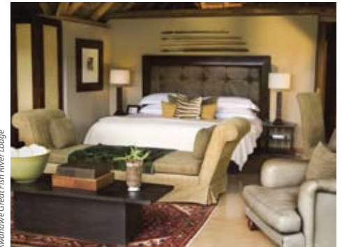
Kwandwe Great Fish River Lodge

Great Fish River Lodge is set along the lush green banks of the river from which the lodge is named. The nine luxurious suites boast overhead fans and air conditioning. The ensuite bathrooms, complete with bath and indoor and outdoor showers, offer unmatched views over the bushveld. Each suite has a spacious thatched veranda, and private plunge pool with terrace. Delicious Pan African meals are served on private decks, in the candlelit dining room, or in the boma under a magnificent starlit sky.