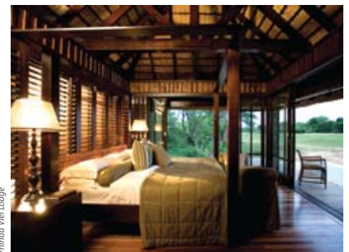
Phinda Vlei Lodge

Fringing the Reserve's unique vlei (wetland) system along the edge of the rare sand forest, this charming lodge comprises six thatched suites decorated in a subtle blend of North and West African styles, with hints of Balinese influences. Each suite, complete with luxurious ensuite bathroom, private plunge pool and game viewing deck, overlooks the grassy vlei where guests can observe herds of grazing antelope, zebra and a dazzling variety of birdlife. Here you can relax in your private plunge pool, or unwind in the comfortable sitting area in front of a warm and inviting open fireplace.