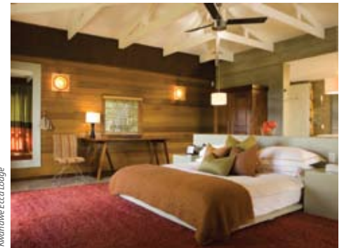
Kwandwe Ecce Lodge

The lodge is set along the steep banks of the Great Fish River in the malaria-free Kwandwe Game Reserve. It is here that you can enjoy bush walks, fishing, canoeing, organised picnics, bush sundowners, rhino-tracking and battlefield & historical tours in and around Grahamstown. There are 6 stylish suites that are spacious and comfortable - in natural tones of burnt aloe, orange, rust and olive hues. Furnishings combine clean contemporary lines, with traditional collectables. This cheerful lodge with a youthful, relaxed vibe is the perfect place for a wildlife experience for the young at heart.