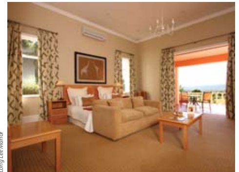
Long Lee Manor

Long Lee Manor is located in Shamwari, the malaria free, private game reserve situated only 40 minutes by road from Port Elizabeth. The Manor, originally built in 1910, offers a distinctive Colonial experience. This splendidly restored Edwardian Manor House offers guests refined comfort, congenial service and enticing cuisine in the African bush. Long Lee Manor consists of 15 elegant en-suite rooms and 3 luxury suites. Sumptuously prepared meals are enjoyed in the main dining room, under the Pepper Tree, or around the open blazing fire at the Barn. A river boma offers an outdoor option for meals.