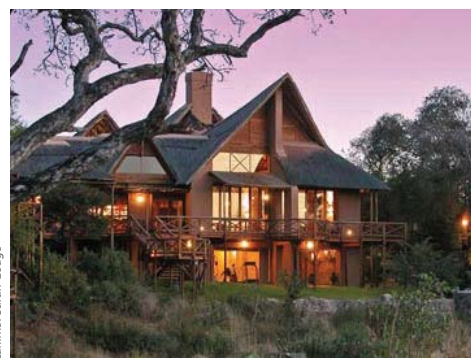
Lukimbi Safari Lodge

Lukimbi is located within the southern sector of the world renowned Kruger National Park, in a large exclusive private concession of prime bushveld (no other vehicles permitted) and is a photographers' delight, both inside the surrounds of the lodge and out in the beckoning bush. Raised walkways lead guests to sixteen spacious suites, all combining luxury and modern African décor including private decks facing the river with stunning views. All suites are air-conditioned, have safes, mini bars, and tea and coffee making facilities. Walking safaris are a highlight at this lodge.