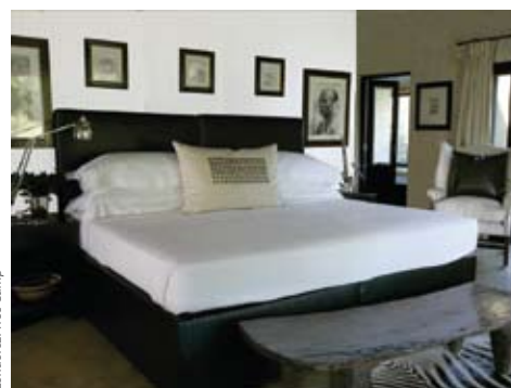
Londolozi Tree Camp

5 star Tree Camp offers elegance and simplicity in every detail and is a showcase of African excellence, from the private swimming pools and contemplation decks, the Ralph Lauren wallpaper to the chocolate coloured plaited beds. It is most famous for its leopard sightings and its bush setting. Guests can spend lazy afternoons on their decks, champagne in hand as they survey the ancient landscape, with elephants and other magnificent bushveld wildlife feeding and drinking from the river below. Game viewing by open 4 wheel drive vehicles is with experienced and personable rangers.