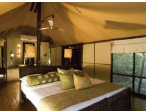
Ngala Tented Camp

Situated on the Mpanamana Private Concession of the Kruger National Park is Shishangeni offering five star accommodation comprising 22 individual chalets, all luxuriously equipped with en-suite bathrooms, outside shower, air conditioning, telephone, mini-bar and timber deck. Here you can dine on traditional cuisine around a roaring boma fire under the stars of the African sky and enjoy vivid storytelling by the local community including many rituals that are still enacted today - forming part of the traditional Shishangeni legend.