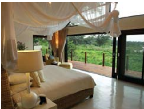
Lion Sands River Lodge

Nestling in the shade on the banks of the Msuthlu River Little Bush Camp features six luxury suites, each with a private viewing deck overlooking the riverbed. Each is decorated in contemporary African design complete with luxury furnishings, full en-suite, indoor and outdoor showers and airconditioning. Thatched roofs, mosquito nets, and beautiful wooden finishes complete the picture of an exclusive safari getaway. This jewel of the South African bushveld boasts all of the features associated with an exceptional safari lodge - beautiful setting, excellent cuisine and abundant wildlife.