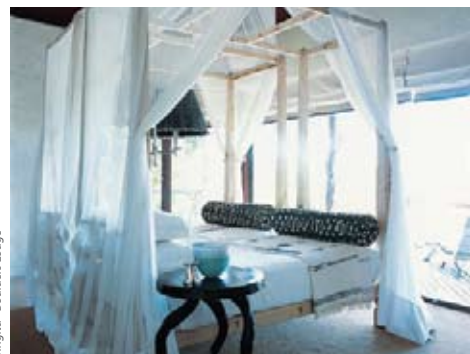
Singita - Boulders Lodge

Singita has one of the best reputations for 5 star accommodation and service. Boulders consists of 9 lavish suites that combine contemporary furnishings with antiques and African fine art. The luxury air-conditioned suites consist of sumptuous bathrooms, indoor and outdoor showers, an expansive living area with double-sided fireplace, mini-bar and fridge, private wooden leisure decks with a private heated plunge pool. Guests can enjoy wrap-around views from most parts of the natural stone lodge, and the lookout deck offers the perfect spot from which to observe wildlife drawn to the Sand River.