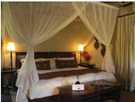
Sabi Sabi Little Bush Camp

Sabi Sabi Bush Lodge is a luxurious safari escape set in the heart of the Sabi Sabi bushveld overlooking a waterhole and an African plain. For decades Bush Lodge has been Sabi Sabi's flagship lodge, famed for its warmth, vibrancy and legendary hospitality. It consists of 25 spacious air-conditioned, thatched-roofed suites all beautifully appointed with exquisite ethnic decor. The en-suite bathrooms feature alfresco as well as glass-fronted indoor showers. Huge viewing decks are the ideal setting to relax while spotting game, birdwatching, or cooling off in the filtered pools.