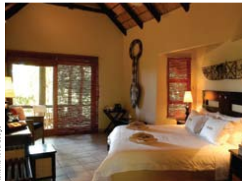
Kuname River Lodge

Kuname River Lodge is a small, exclusive, luxury safari lodge set in pristine African bush, in the Karongwe Private Game Reserve. Accommodation is in five private, luxury chalets, all decorated in an elegant African style. The en-suite bathrooms include an outdoor shower as well as a luxurious outdoor bath. Bordered by the towering Drakensberg escarpment on the west and set in game-rich, lush, riverine vegetation, Kuname offers a variety of breathtaking views, diverse landscapes and some excellent game-viewing opportunities all at exceptional rates.