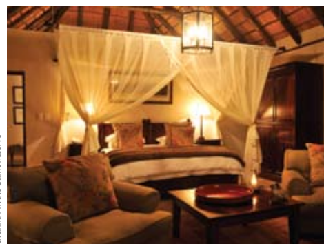
Savanna Private Game Reserve

Savanna Private Game Reserve is small and intimate with only four luxury suites, three executive suites with private plunge pools and one two bedroom suite with lounge and dining room. The suites all combine the romance of a tented roof with the sophistication of a permanent structure. They all have indoor and outdoor showers, fully stocked mini-bar, in room safe, air conditioning and private verandah. Specially designed game viewing vehicles and highly trained guides with vast knowledge of the African bushveld, take guests on close and intimate encounters with a large variety of wildlife.