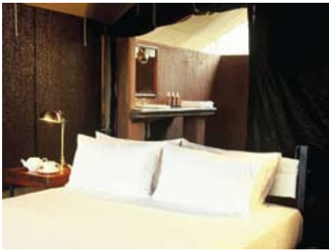
Honeyguide Mantobeni Camp