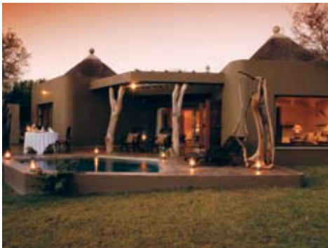
Sabi Sabi Bush Lodge

This tented camp is designed to reflect Hemmingway's Africa. The 12 large Nehru-styled ensuite tents are comfortably furnished with kingsized beds and soft leather couches. All meals, refreshments, game drives and walking trails are included in the rate and a full bar service is available. Honeyguide operates ecosafaris in a vast private concession area by open game viewing vehicles or on foot under the guidance of armed and experienced rangers. Game visiting the nearby watering hole can be seen from the swimming pool deck adjoining the reception areas.