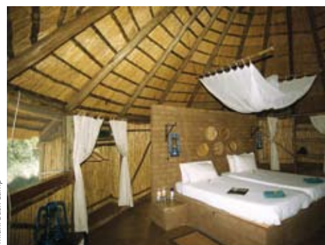
Umlani Bush Camp

Accommodating a total of sixteen guests, this classic African safari camp provides understated luxury in traditional reed and thatch huts, enhanced by the romance of operating without electricity. Each of these huts has en-suite facilities - with open air bush showers fuelled by wood fires. It is a lovely place to 'get back to nature' by relaxing in the warm atmosphere of candlelight and oil lamps. Game drives are conducted in open Land Rovers, with guided bush walks and tracking game on foot with highly experienced rangers and trackers.