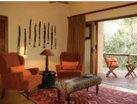
Shishangeni Private Lodge

Camp Jabulani in Kapama Game Reserve is home to Jabulani the elephant and 12 Zimbabwean elephants, all rescued by owner, Lente Roode. Camp Jabulani offers luxurious accommodation in 6 elegant and spacious suites each with its own en-suite bathroom. The comfortable beds are all fitted with pure cotton sheets and the bathroom features a bath and an outdoor glass-enclosed shower. Each suite has a private plunge pool. There is also a spa for a soothing massage. One of the great highlights is the chance to take an elephant back safari.