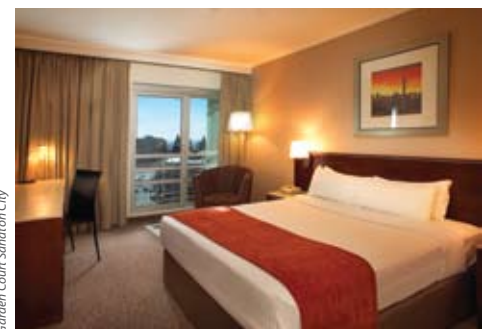
Garden Court Sandton City

Convenience and comfort at Garden Court Sandton City caters for both the business and leisure traveller. Ideally positioned in the Sandton business district where guests are over the road from the Sandton Convention Centre, Sandton City Shopping Centre and Nelson Mandela Square. The stylish décor encompassing a hint of art-deco reflects the Garden Court Sandton City's modern hospitality and extends through to each of the 444 spacious en-suite rooms, each air conditioning and offering in-room dining.