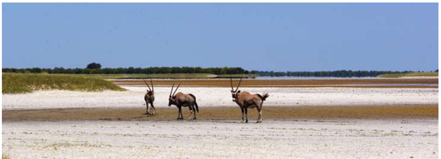
Makgadikgadi Salt Pan