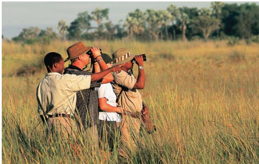
Walking safari in the Delta

NOTE: 6 buffet style dinners can be pre-bought - price on request. Contact African Travel Specialist for full details and departure dates.