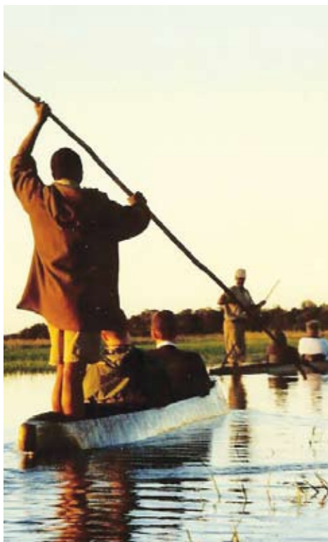
Mokoro Ride on the Okavango Delta

This exciting safari explores the stunning beauty and continually moving game of northern Botswana: from walking on islands in the Okavango Delta, to the diverse, wildlife-filled Linyanti concession, with its seasonal elephant herds. The camps are located in a range of different habitats to maximise the best possible game viewing. This scheduled safari takes a maximum of eight people.