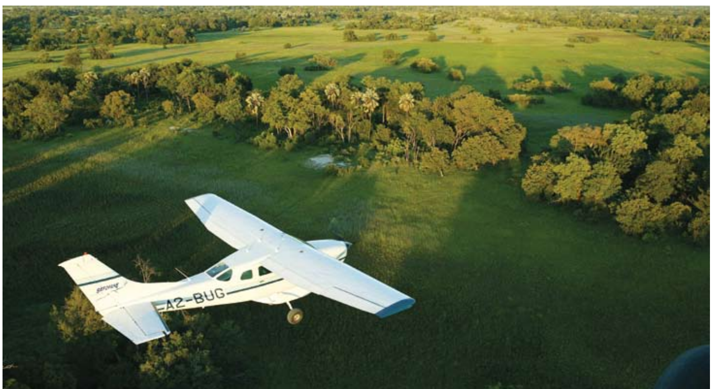
Flight over the Okavango Delta