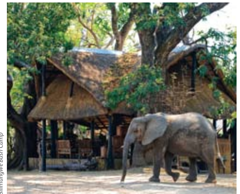
Bilimungwe Bush Camp