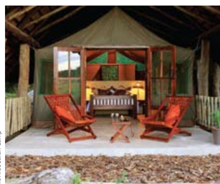
The Hide Safari Camp

NOTE: Based minimum 2 passengers travelling together. Tour departs Saturdays.