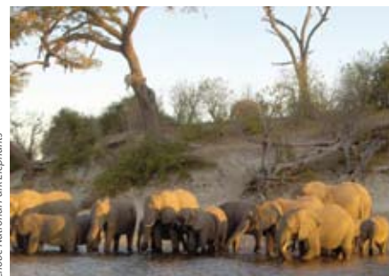
Chobe National Park Elephants

NOTE: Based minimum 2 passengers travelling together.