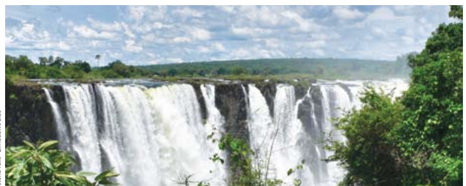
Victoria Falls - Zimbabwe Side