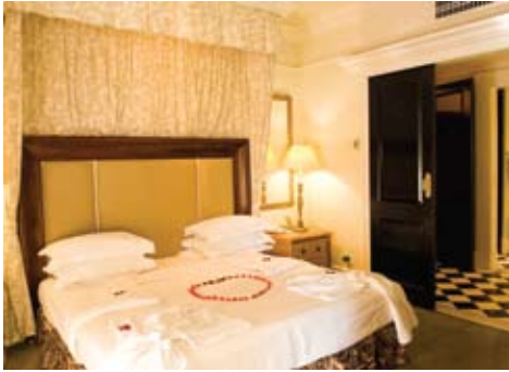
The Royal Livingstone