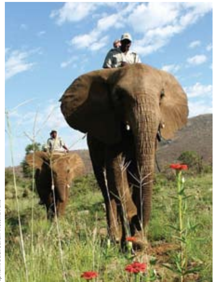
Elephant Back Safari Victoria Falls