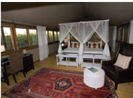
Toka Leya Camp

The River Club is situated on the Zambian side of the Zambezi River, about 18 kilometres upstream from Victoria Falls. Each chalet has one side completely open to the river, so that there is an uninterrupted view of the Zambezi River and glorious African sunsets from both bed and bathtub. Ten luxury chalets are spread out amongst the riverine vegetation, comprising luxurious bedrooms and en-suite bathrooms, most being split-level. River Club features in-house activities including river cruises, tennis, fishing, a running track, gym, jacuzzi, sauna, croquet, nature walk and games room