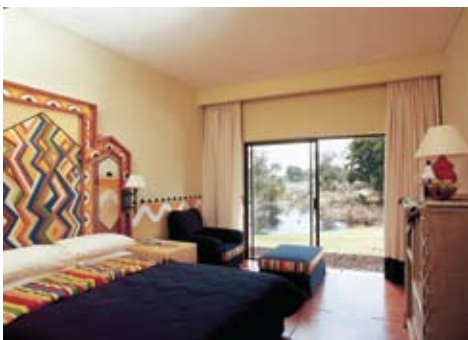
The Zambezi Sun

Toka Leya Camp overlooks the mighty Zambezi River and consists of 12 spacious en-suite safari-style tents. Wooden walkways snake between rooms and the main area. Tent interiors boast cool wooden flooring, tasteful, uncluttered African décor, climate-control, and an expansive wooden deck. The camp's dining, lounge and bar areas offer ample space for relaxation and are complimented by an infinity pool. Meals can be served on the sundeck, the pool deck or in the dining room which all overlook the mighty Zambezi River.