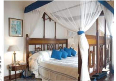
Zanzibar Serena Inn

Idyllically situated on the sea-front of ancient Stone Town, and flanked by an exotic mix of sultan's palaces, Portuguese forts, ancient dhow harbours, and bright bazaars, the Zanzibar Serena Inn is a haven of tranquillity. This hotel offers the best in island hospitality, with 51 bedrooms overlooking the Indian Ocean, along with a private swimming pool. With high ceilings, shuttered windows and cool white walls, the rooms are constructed in the traditional Swahili manner and feature large four-poster beds and private balconies.