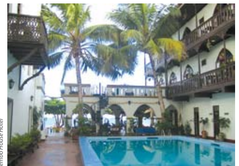
Tembo House Hotel

The three star Tembo House Hotel is situated in the heart of Stone Town with picturesque beach frontage. It is furnished with an array of antique furniture and ornaments from all over the World. Tembo House also features a swimming pool, wireless internet access, and the Bahari Restaurant which offers excellent local as well international cuisine. With its first class location, service and facilities, Tembo House Hotel will provide everything you need to make your stay in Zanzibar a memorable one.