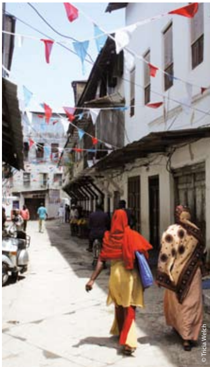
Stonetown - Zanzibar

Prices includes: Return airport transfers, 2 nights accommodation with breakfast