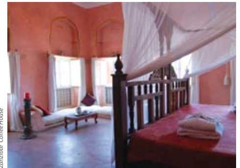
Zanzibar Coffee House

The Zanzibar Coffee House is an authentic Arabic house, originally built in 1885, in the heart of Stone Town. The property has 8 individually designed rooms, with air conditioning, traditional four-poster beds, lavish mosquito nets, antique furniture and rich fabrics. The Zanzibar Coffee House has an authentic coffee shop on the ground floor which attracts a mix of locals, tourists and expats, offering a friendly buzzing atmosphere. It also has an authentic Swahili style roof-top restaurant with fantastic views, - a definite highlight!